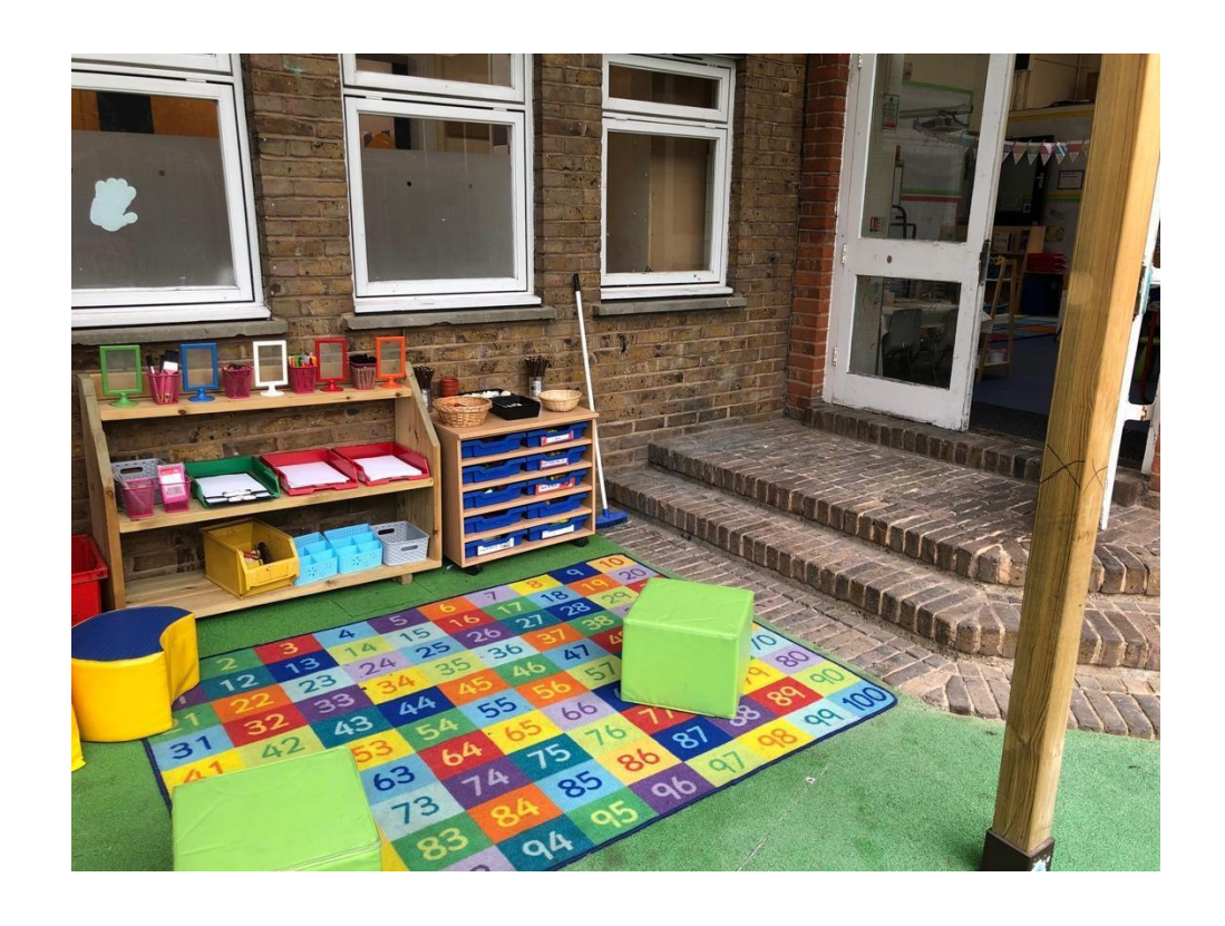
I can play outside with lots of different things.