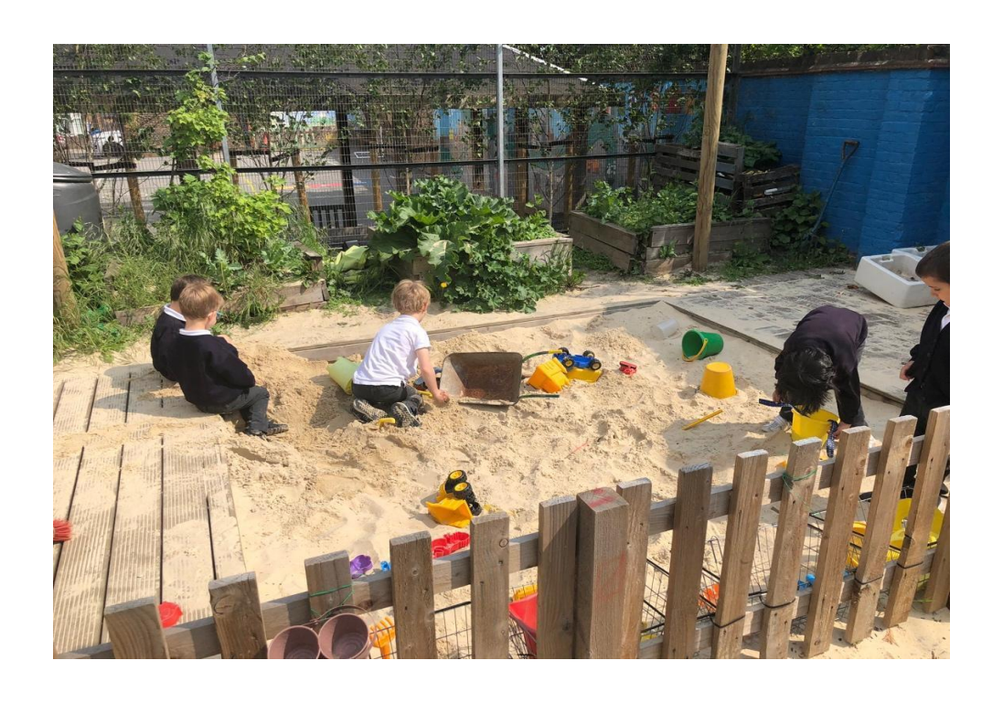
I can play in the big sandpit.