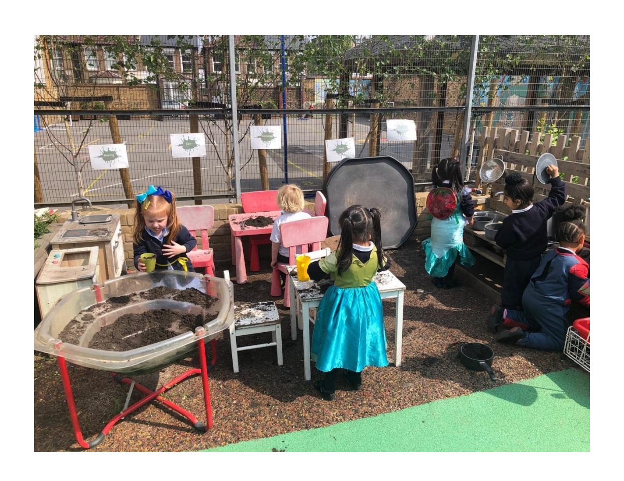
I can play in the mud kitchen.