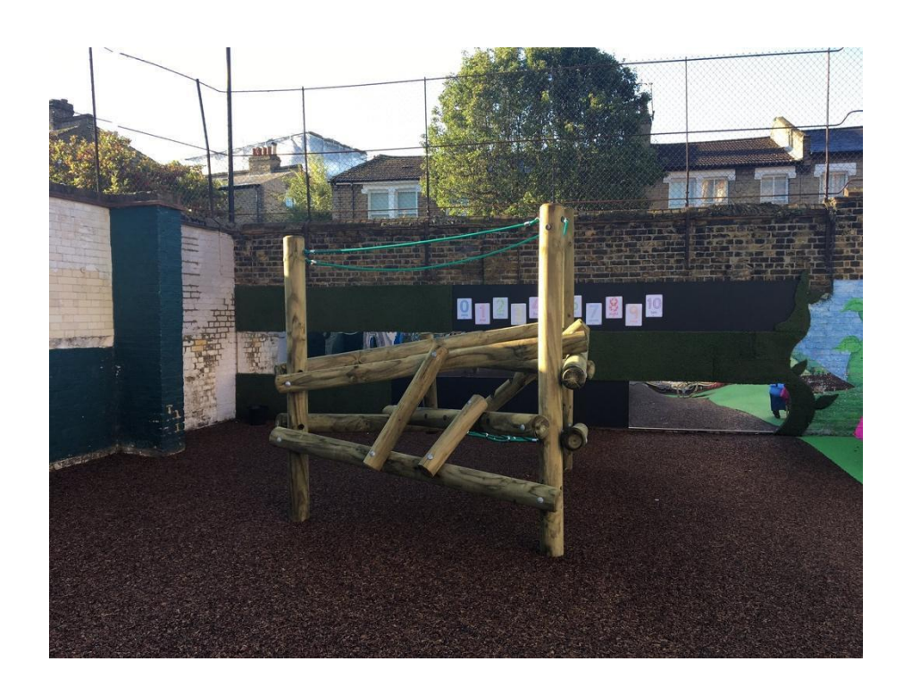
I can learn how to climb safely on the climbing frame.