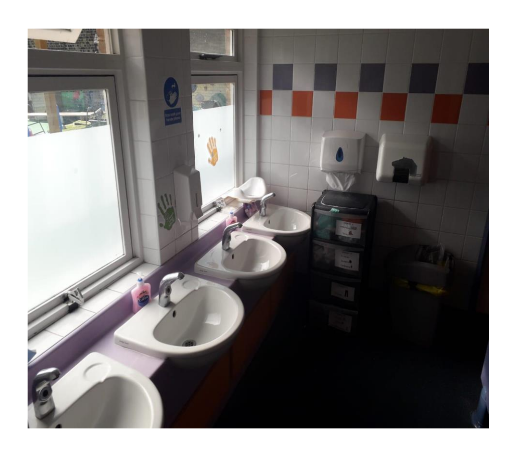
This is where I can go to the toilet and wash my hands.